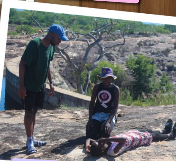
#First Aid Training