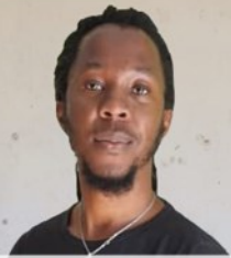
Thamu IT Support

Seeing the smiles and joy on learners' faces.