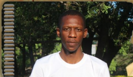
Denver IT Support