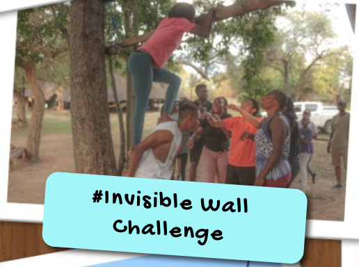
#Invisible Wall Challenge