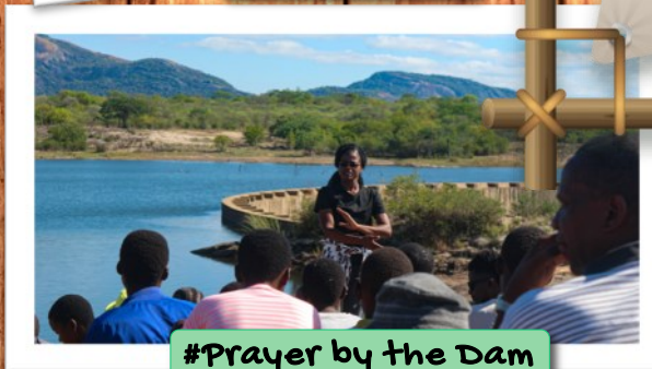
#Prayer by the Dam