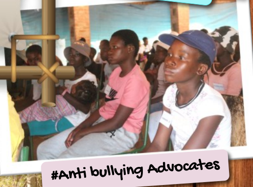
#Anti bullying Advocates