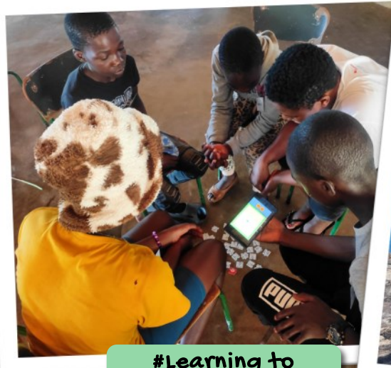
#Learning to Code